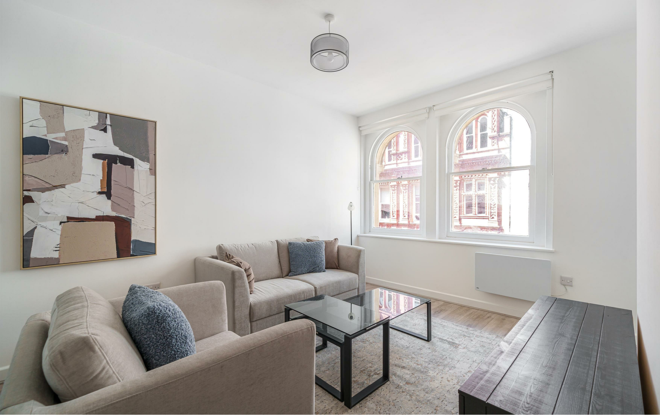
Flat 7 Cheltenham House, Clare Street Bristol, Gloucestershire BS1 1YA £1,900 Per Month